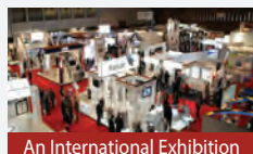
An International Exhibition

AgriLivestock Cambodia'17 is an integrated event for the agriculture industry which will include