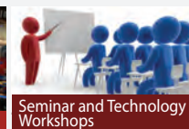
Seminar and Technology Workshops